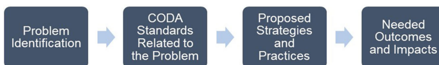
FIGURE 1 Conceptual illustration of the logic model approach used to develop the antiracism framework for predoctoral dental education accreditation standards. CODA, Commission on Dental Accreditation

retaliation and/or disbelief that such concerns will be adequately addressed. 29,30 In addition, due to low numbers of HURE students and faculty, even anonymous humanistic surveys may not allow them to voice their concerns.